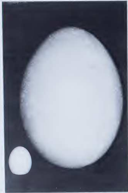
Figure 1 The Cervantes egg compared with that of a chicken egg.

them. In the case of Aepyornis , a third outer layer is present.